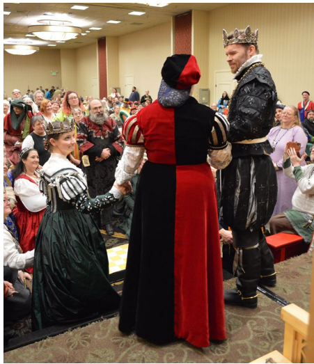
Pic 1.