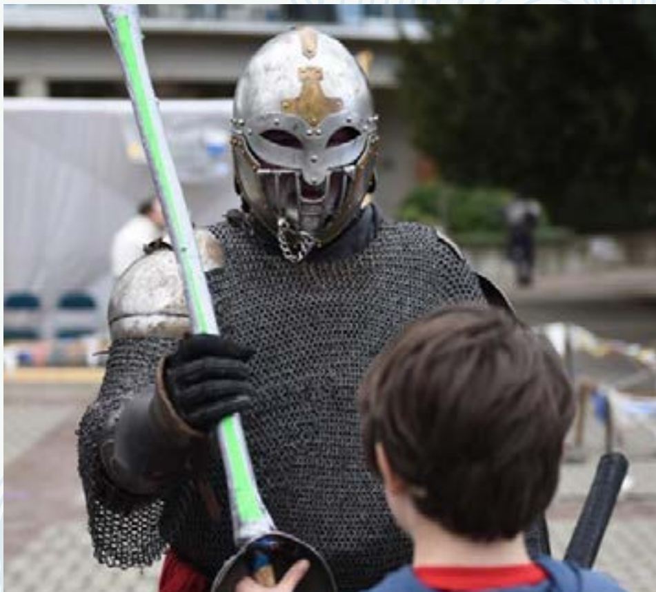
Let's get medieval!