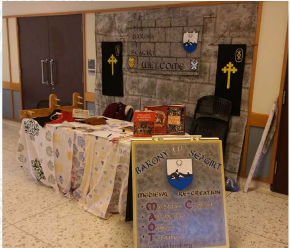
Our Booth at the Tsukinocon for our Demo.