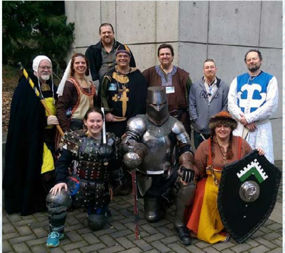
A Wild group of Seagirtians at TSUKINOCON.