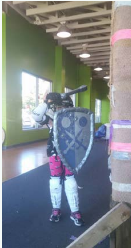
Pel Pole Work.

The weekend practice is held Sundays 1-3pm and the weeknight practice is on Wednesdays 7-9pm.