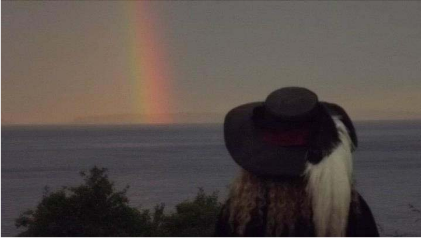
A Beautiful Rainbow appears in the distance at Seaside Tourney