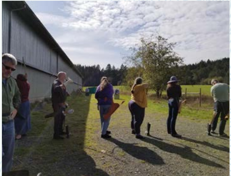
Archers on the line. Get your scores in for the season by October 31!