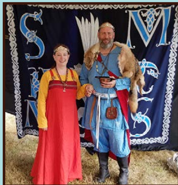
Their Highnesses of The Summits Prince Njall Tjorkilsson Princess Ellisif in Vaena