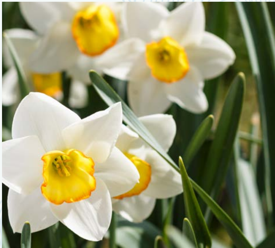
Happy Daffodil everyone!