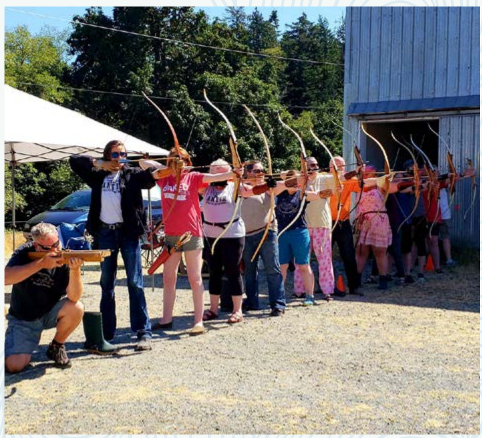
Already missing the summer days!