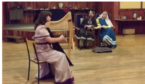
Our 3 Bardic Competitors